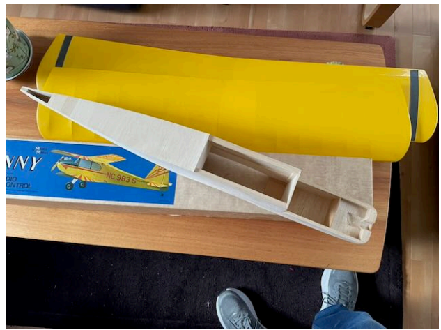
SIG Clipped Wing Cub fuse, wing, horizontal stab and rudder mostly built. some wood and plans in box