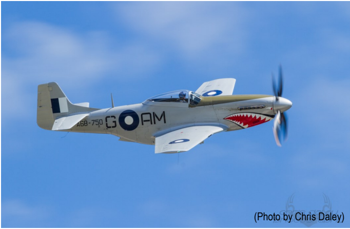
The RAAF Museum's Commonwealth Aircraft Corporation CA-17 Mustang.