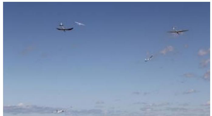
A feature of this day is the mass launch of electric powered foam gliders. Not a lot of entries on this occasion but still quite spectacular.