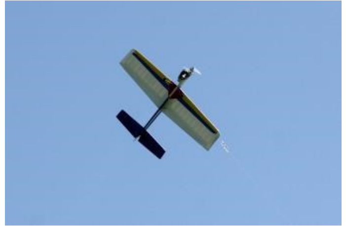
The Sukhoi may be a profile model but it can hold its own with the top models.