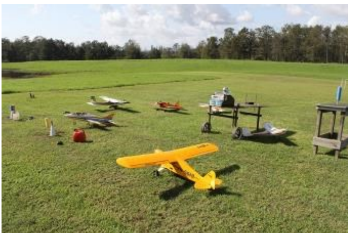
Models in the pits.