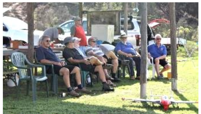
Eurobodalla club members relaxing in the shade.