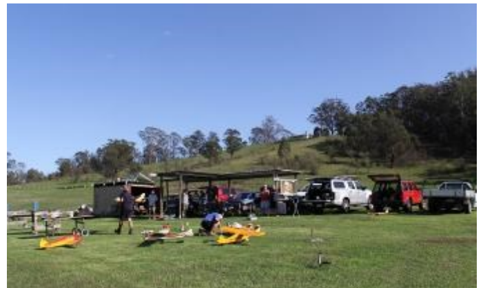
The Eurobodalla club is located a few kilometres east of Moruya on the north side of the Moruya river.