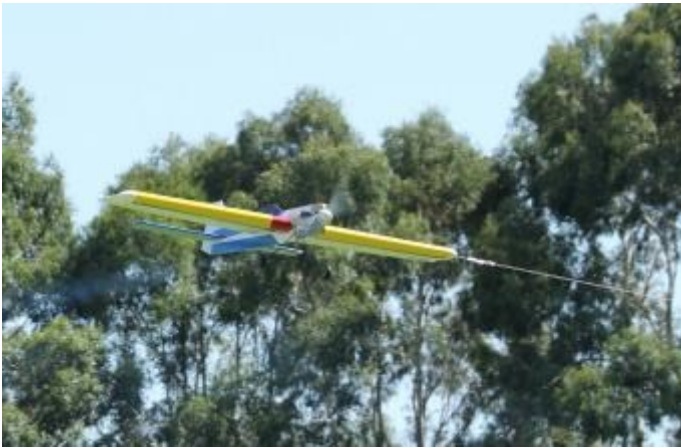
David Nobes' profile Sukhoi in flight.