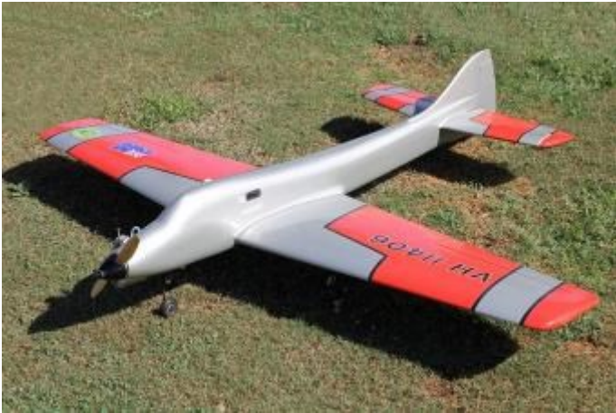
Norm Morrish had a back up model with this Squirrel powered by a Webra Speed 61.