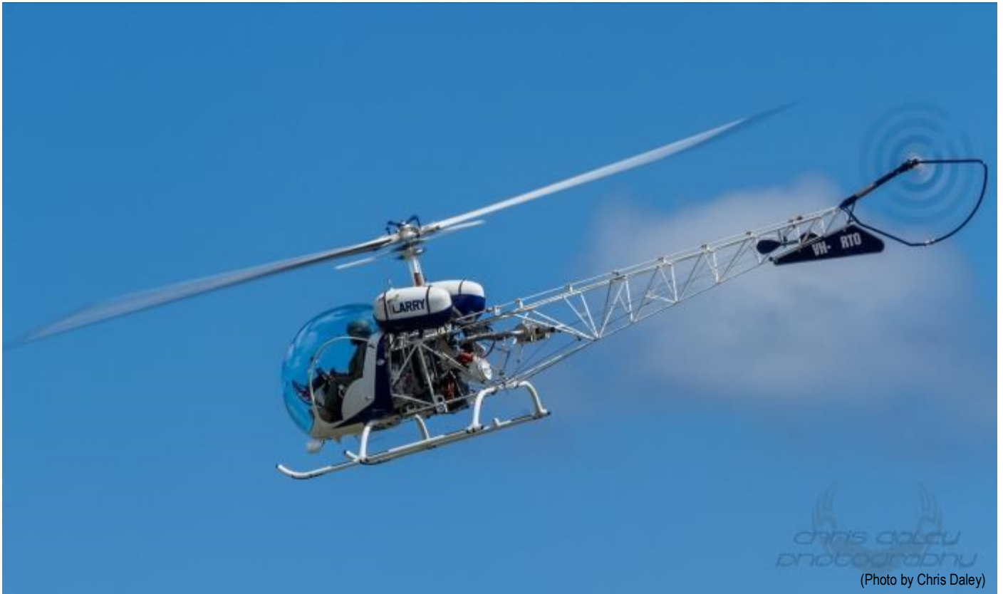
A privately owned Bell 47G. This type of helicopter was widely used in the Korean War and became well known from its frequent appearance on the TV show 'MASH'.