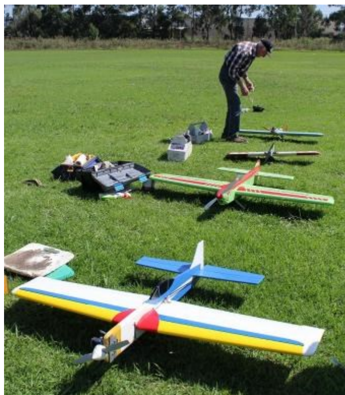
Four models were presented for the competition with only three actually taking part.

The lack of support for this event was rather alarming and brings into question the future of these aerobatic events which once displayed the very best in control line flying and aerobatic model design.