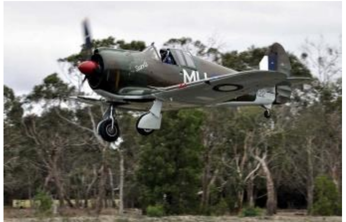
Commonwealth Aircraft Corporation CA-12 Boomerang.