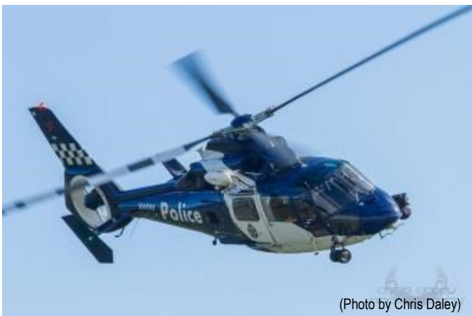
A Eurocopter AS365 Dauphin 2 of the Victorian Police Air Wing.