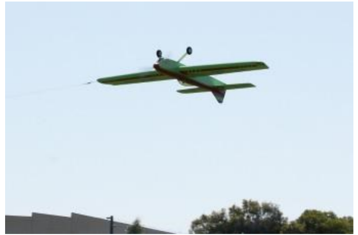
Derek's Starcraft flying very steady inverted laps.