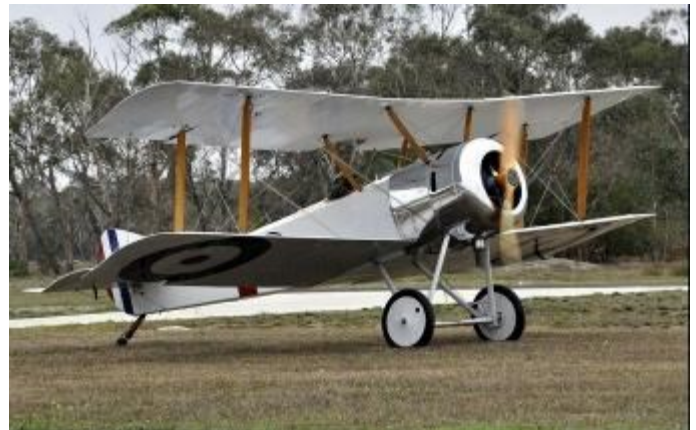
The RAAF Museum Sopwith Pup.