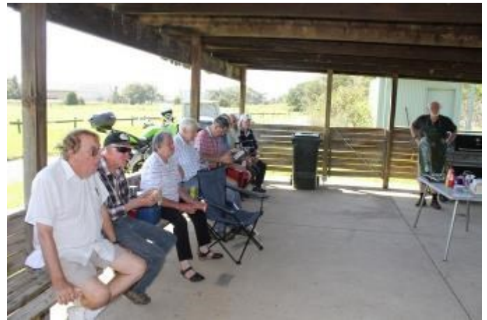
An open meeting of the KMAC was held during the lunch break. Further comments are available to KMAC members on the KMAC website.