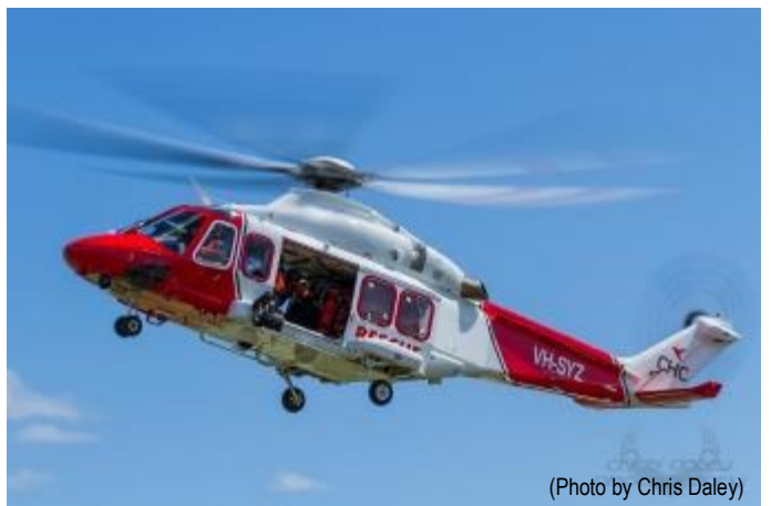
Agusta Westland AW139 rescue helicopter.