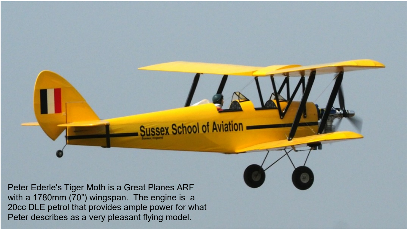
Peter Ederle's Tiger Moth is a Great Planes ARF with a 1780mm (70") wingspan. The engine is a 20cc DLE petrol that provides ample power for what Peter describes as a very pleasant flying model.